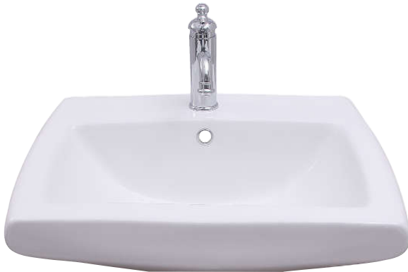
Faucet not included