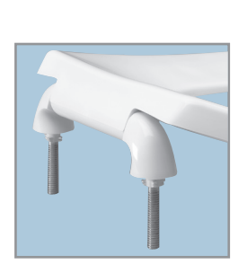
PLASTIC HINGES WITH STAINLESS STEEL POSTS AND PINTLES

Non-Corrosive 300 Series Stainless Steel Posts and Pintles