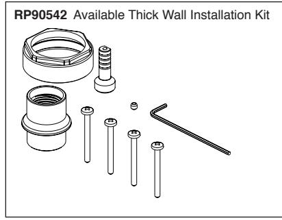
▲ Designate Proper Finish Suffix