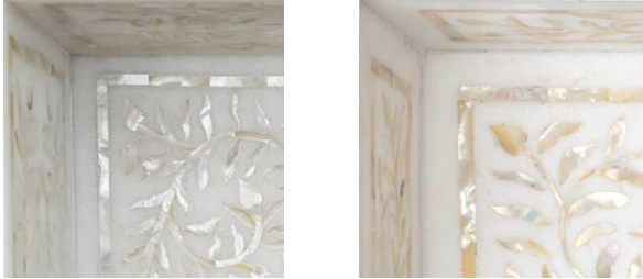
Mother of Pearl color will vary from sink-to-sink