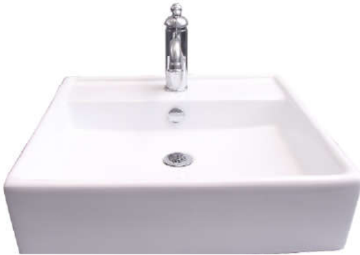
Faucet not included